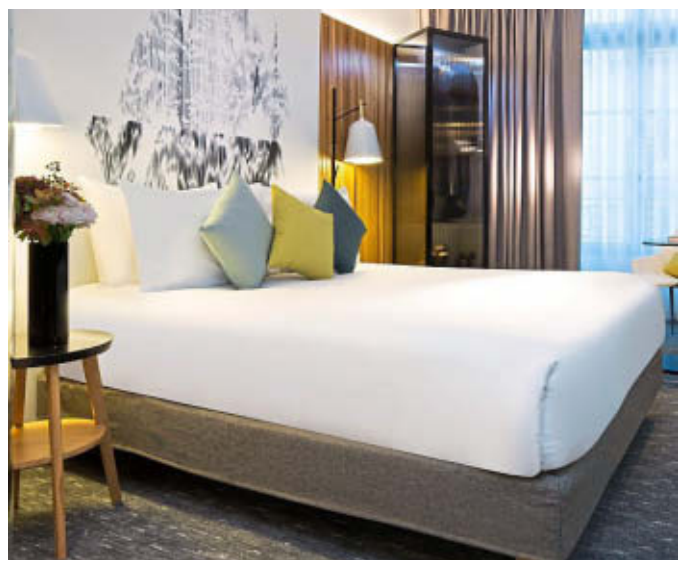
Art attack: The decor at the Drawing Hotel (left) is bold and unusual, while its bedrooms (above) feature artwork on the walls