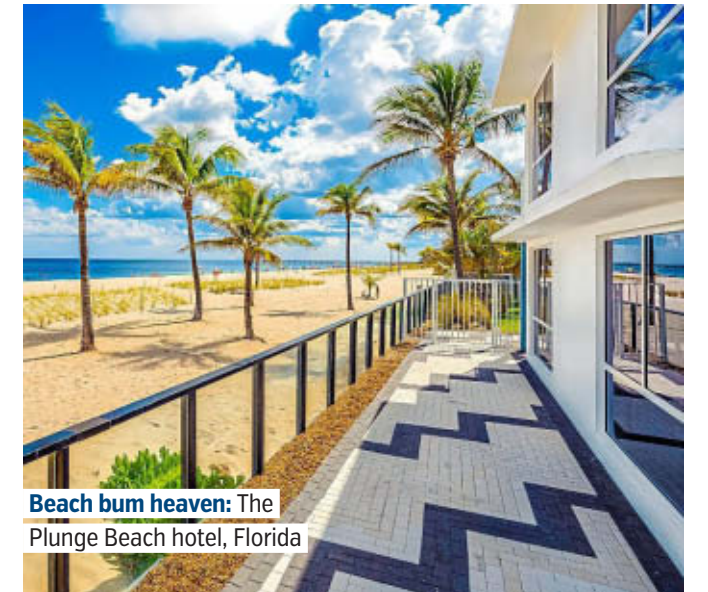
Beach bum heaven: The Plunge Beach hotel, Florida