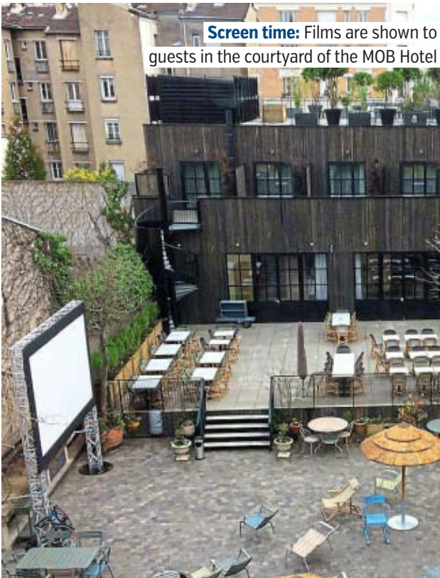
Screen time: Films are shown to guests in the courtyard of the MOB Hotel