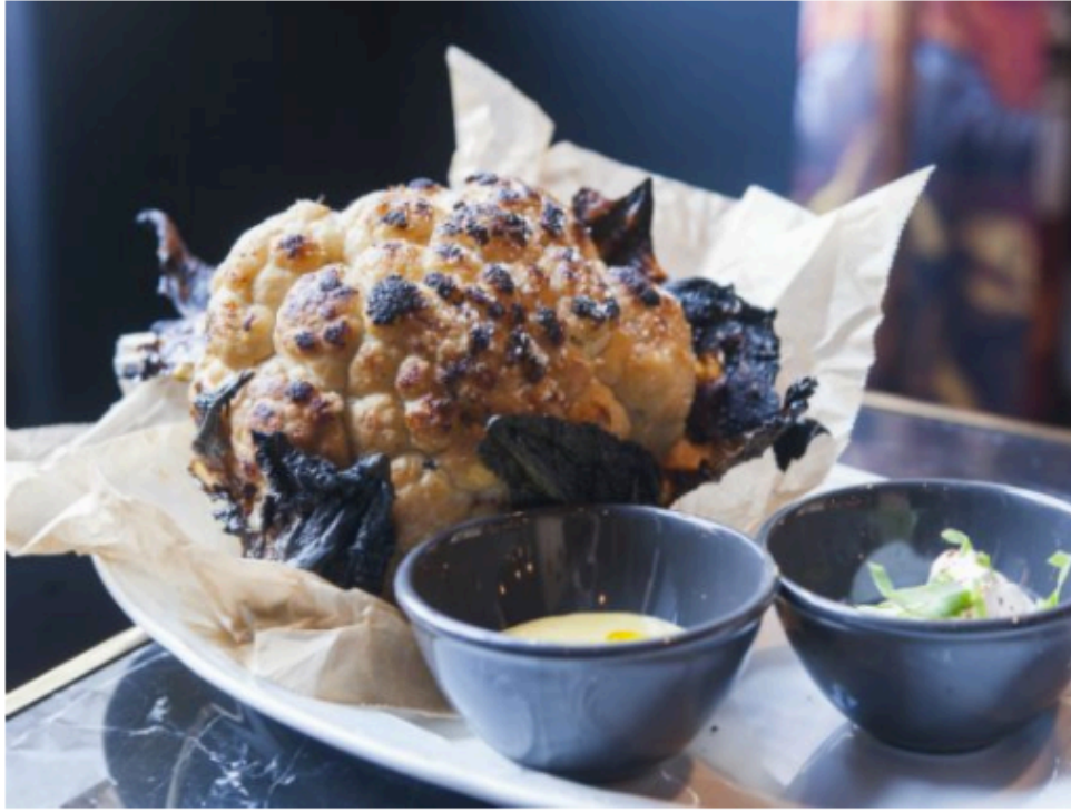
The grilled cauliflower at the MOB Hotel.

Before leaving, sign your name on the graffiti mirror and take one last photo in the Starck designed photo booth. Print photos of your MOB experience from your cellphone, USB flash drive or directly via Bluetooth, and set off with all your memories preserved on glossy paper.