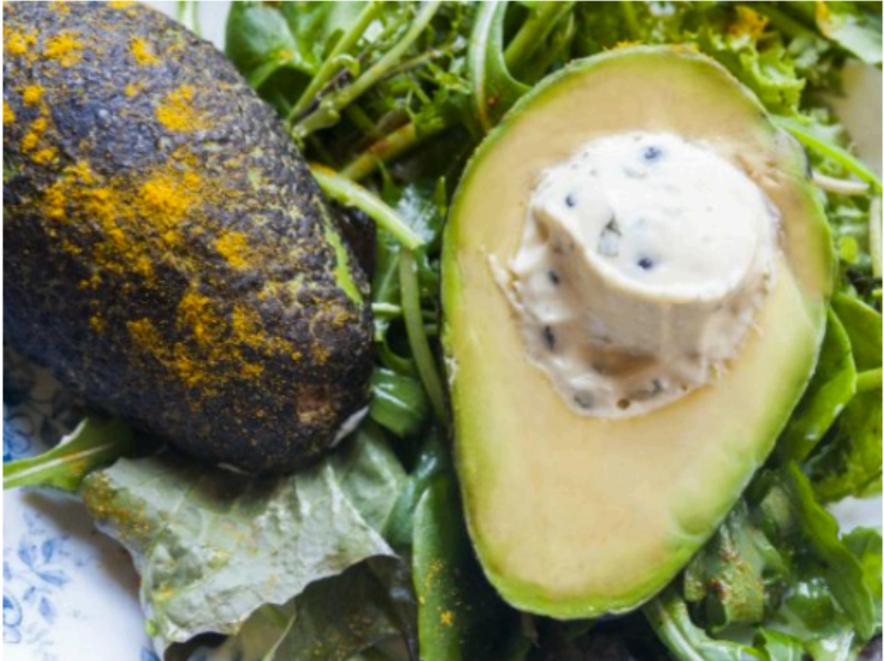
Avocado at the MOB Hotel restaurant.

The delightful restaurant area (90 inside – 90 outside) with picture windows and covetable fresque printed curtains overlooks the terraces and gardens. It sprawls informally over a huge space the centerpiece being a magnificent 3-ton central oven watched over by chef Brice Morvent, a talented M6 Top Chef finalist. His mission is to use only seasonal organic ingredients, so you are unlikely to eat the same thing twice. The food's simple – no Sunday Brunch– not in line with MOB's philosophy. On the short menu (organic wines, beers, fresh juices and smoothies), say tasty Tajine of chicken, carrots and potatoes (20€). Do taste the "grilled cauliflower" inspired by Israeli street food (10€), Burnt Avocado (10€), copious Salade Niçoise (14€) and sensational pizzas (12-16€). The wine card includes Michel Reybier's excellent Goulée by Cos d'Estournel Medoc White (49€).