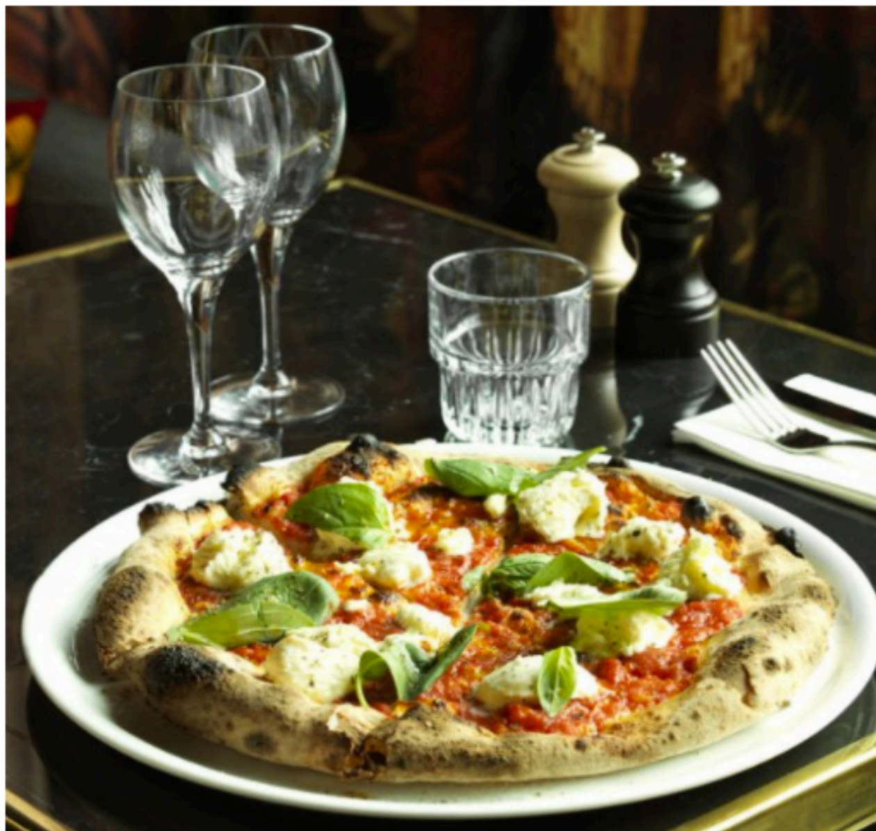
Organic food at MOB Hotel.

Not only food in the restaurant but a big table football game for 8 people, a fireplace, Hemingway library (take and leave books) and a traditional Parisian zinc bar – downstairs, in the rest room, philosophy lectures broadcast non-stop!