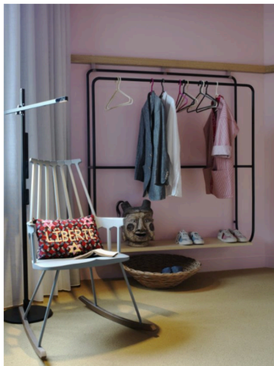
Room at the MOB Hotel.

MOB Hotel & Restaurant Paris Les Puces, 4-6 rue Gambetta, 93400 Saint-Ouen, Metro Garibaldi, Tel: +33 (0)1 47 00 70 70. Website: www.mobhotel.com