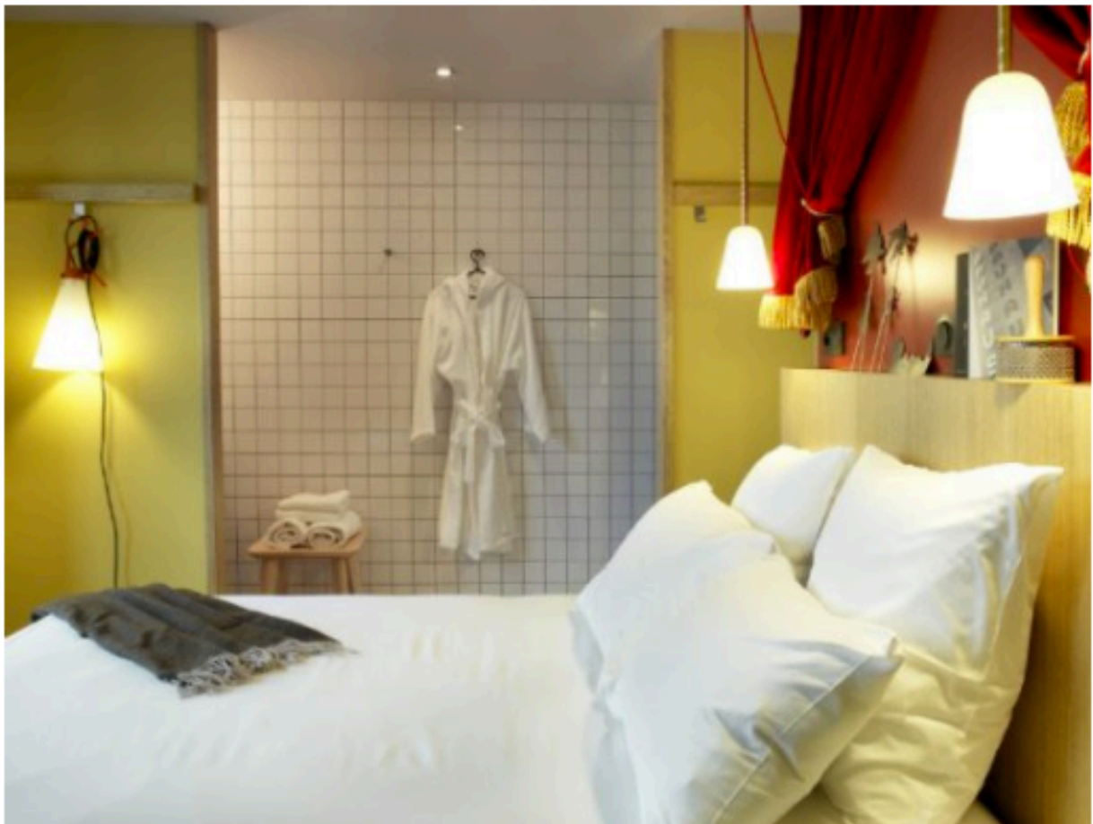
A room at the MOB Hotel.

MOB is the red brick factory industrial style building on rue Gambetta, five minutes from the buzzing Saint-Ouen Flea Market , an exciting up-and-coming quartier on the move.